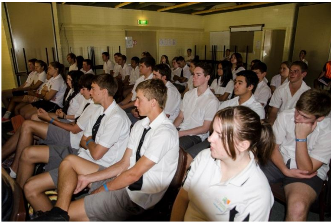
Year 11 students at the RYDA presentation.