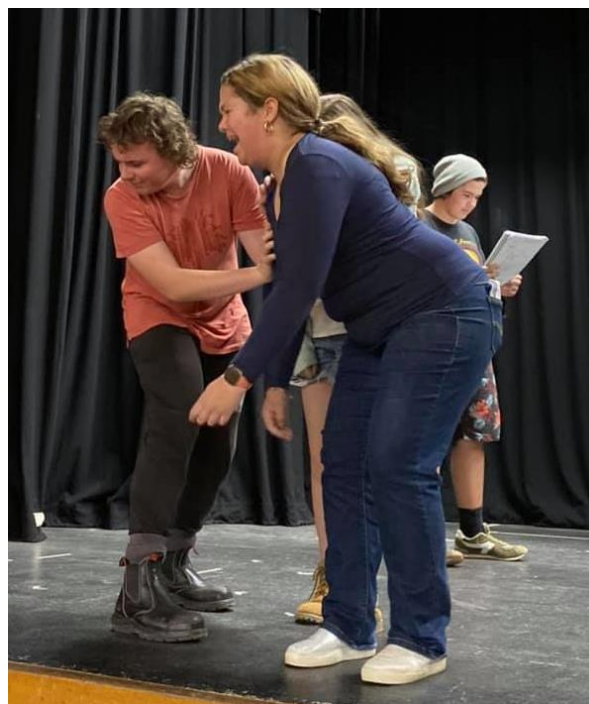
“Mama’s in the mud, Mama’s in distress!”